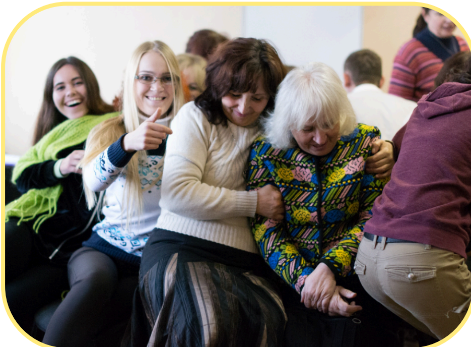
Fun activity during an in-person training

Our training model is both proven and practical. We work through flexible formats designed to meet teams wherever they are: self-paced video learning supported by guided consultations, live online sessions, and hybrid trainings that combine in-person practice with online teaching. This flexibility has been essential. Power outages, travel risks, and the relentless pressures of life in a war zone make rigid schedules impossible. By adapting to those realities, we have enabled children's workers, teachers, and volunteers across the country to keep serving their communities with skill and confidence.