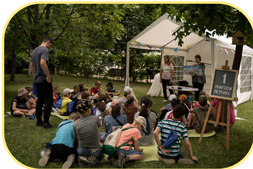
OpSAFE photo (Children listening to a therapeutic story at OpSAFE camp in Kyiv Oblast)

The teams we trained in 2025 conducted 16 OpSAFE Trauma Care programs (including camps, clubs, and Sunday school settings) that benefitted 520 children. 39 holiday programs (one-day-long Christmas and Easter program) provided short-term trauma care support to an additional 1,667 children.